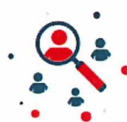
Complaints Officer & Arbitration Committee

Other channels for reporting include directly to the Complaints Officer & Arbitration Committee, the Ask HR email address , and the Staff Association .