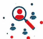
Complaints Officer & Arbitration Committee

Misconduct can only be prevented if systems are in place to allow confidential, professional investigation of any person suspected of misconduct, and effective disciplinary measures should the allegations against them be proved.