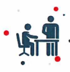
Any senior manager