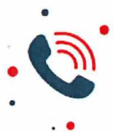
GIMD Antares IFRC Safecall

Anyone affected by misconduct and abuse – victim or witness – can alarm & report, HR in Headquarters or Country Offices, any senior manager, or ask a trusted colleague to make the complaint on their behalf. You do not have to give your name but anyone who does identify themselves is protected by the Whistleblower Protection policy.