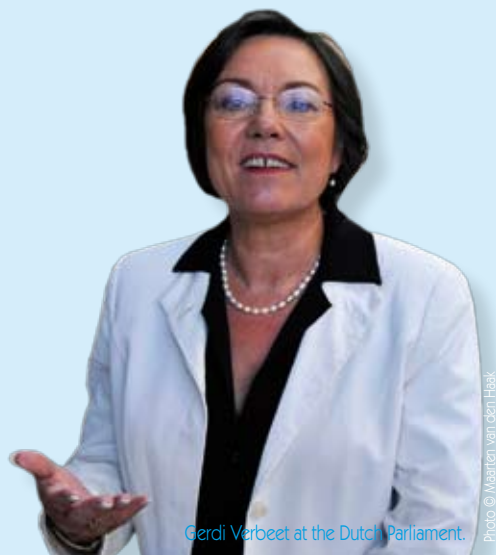
Gerdi Verbeet at the Dutch Parliament.