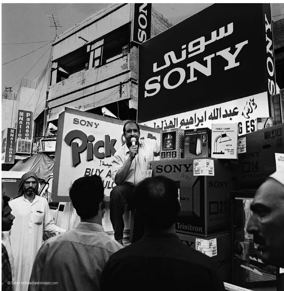
The world has become truly wired.

bigotries so that we can write a fair article or news report? How much have we managed to understand ourselves so we can teach others about what makes us different and similar at the same time? We have to seek ways to build a bridge that ensures a fair perception of each other, a fair understanding of each other's value system and a fair appreciation of the differences that make us unique, so we can truly belong to one planet.